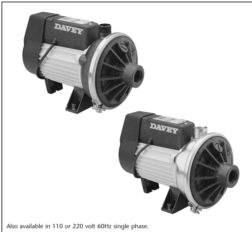
Also available in 110 or 220 volt 60Hz single phase.